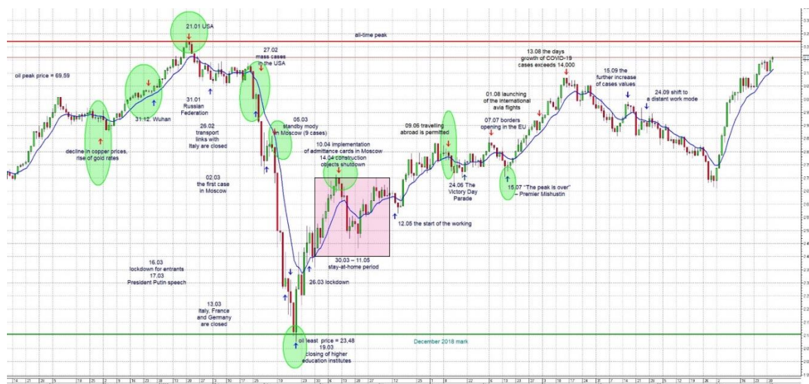
Figure 1. Dynamics of the MICEX index.

At the same time, the economy does not have such a catastrophic reaction to the next sanctions against Russia, endless political games around our infrastructure and oil and gas projects.