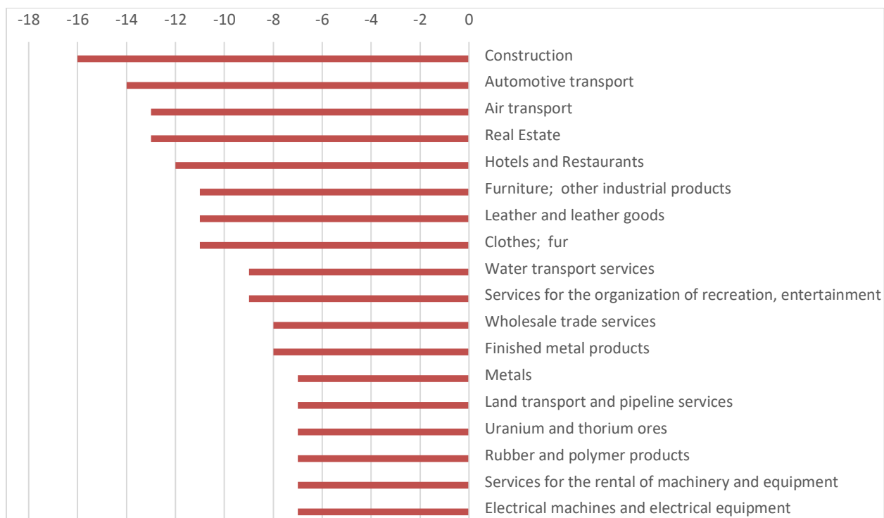
Figure 2. Activities with a production decline of more than 6%.